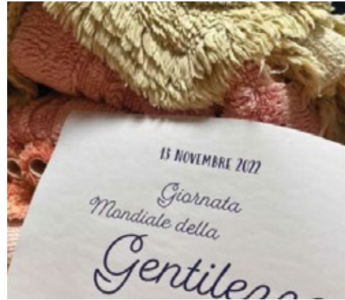
FGL International promotes the Code of Sports Ethics