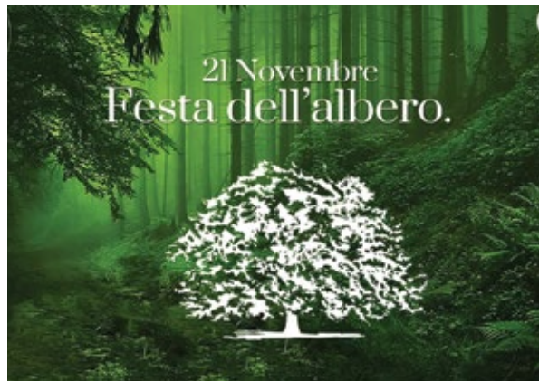
FGL contributes to a reforestation project