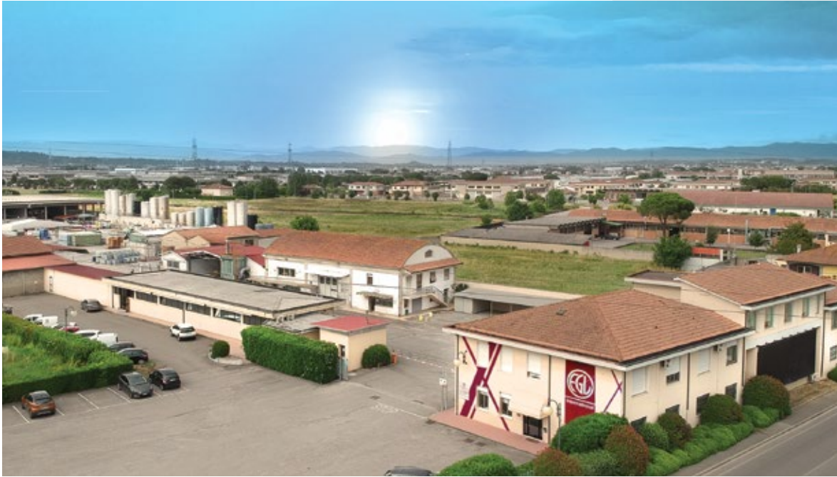
Castelfranco di Sotto (PI)