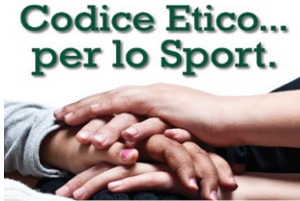
FGL International promotes the Code of Sports Ethics