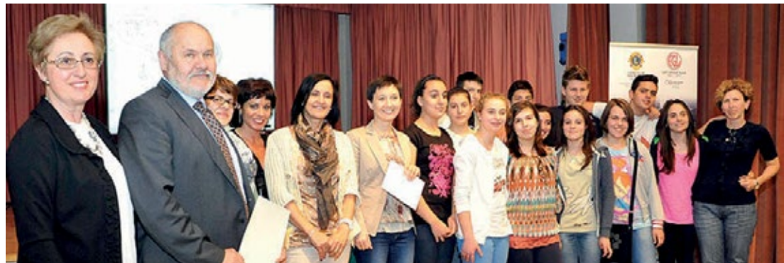
FGL promotes campaigns to raise awareness on the dangers of smoking and alcohol