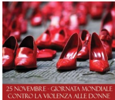
FGL combats violence against women